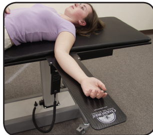
Supine Position at 180°