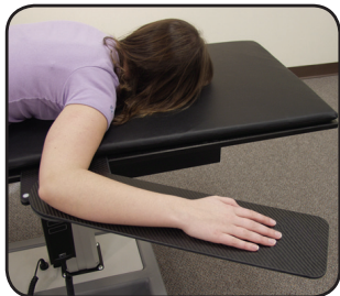
Prone Position at 135°

Rotate the Support Section to the desired position. This section rotates up to 180°.