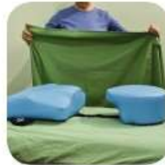
Lay extra sheet over table & torso cushion. Fold top end of sheet down to edge of torso cushion as shown, still covering entire torso cushion.