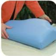
Place torso cushion on table about 1 foot from end & aligned with back side.

Fold this extra sheet (twin flat sheet is recommended) to a width to completely cover the torso cushion and the headrest. Tuck any excess length under the torso pad. Allow adequate extra sheet for shoulder to fit between headrest and torso cushion. This makes the transition to a back rest position very easy.